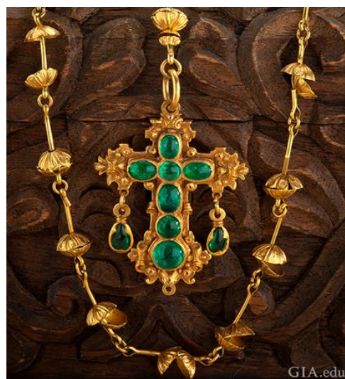
An emerald cross and gold rosary recovered from the Nuestra Señora de Atocha

https://www.gia.edu/birthstones/may-birthstones