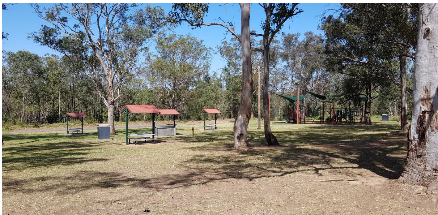
Ingleburn Reserve Picnic Grove - 267 Bensley Rd, Ingleburn