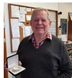
Raffle: 1st Prize Winner