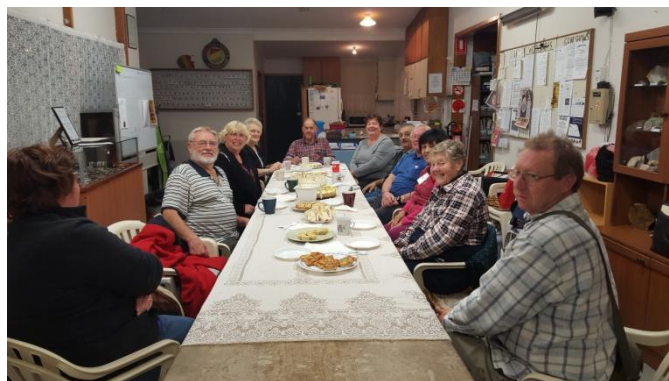
The Friday night Silver group's biggest morning tea

The Biggest Morning Tea was on for a week at the club from Monday 23rd - Saturday 28th May. The cakes and food were yummy. We raised $86.00 plus $30.00 for the raffle. so total $116.00.